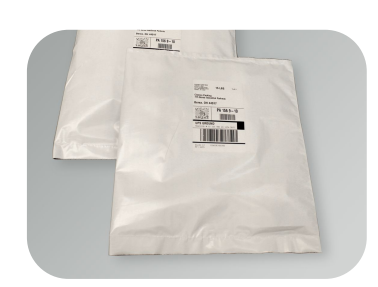
Coex Poly Mailer Rollbag bags on a roll for mail order fulfillment