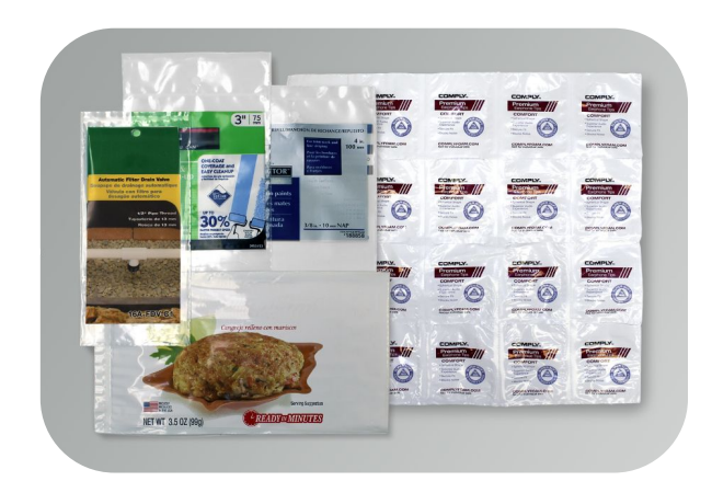
Custom printed rollbags can be configured with a variety of features to create the perfect bagging solution for all products