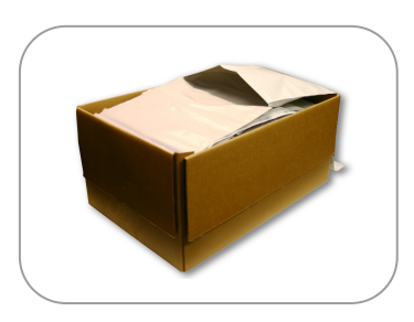
Coex Poly Mailer Rollbag bags fan-folded in a box for mail order fulfillment